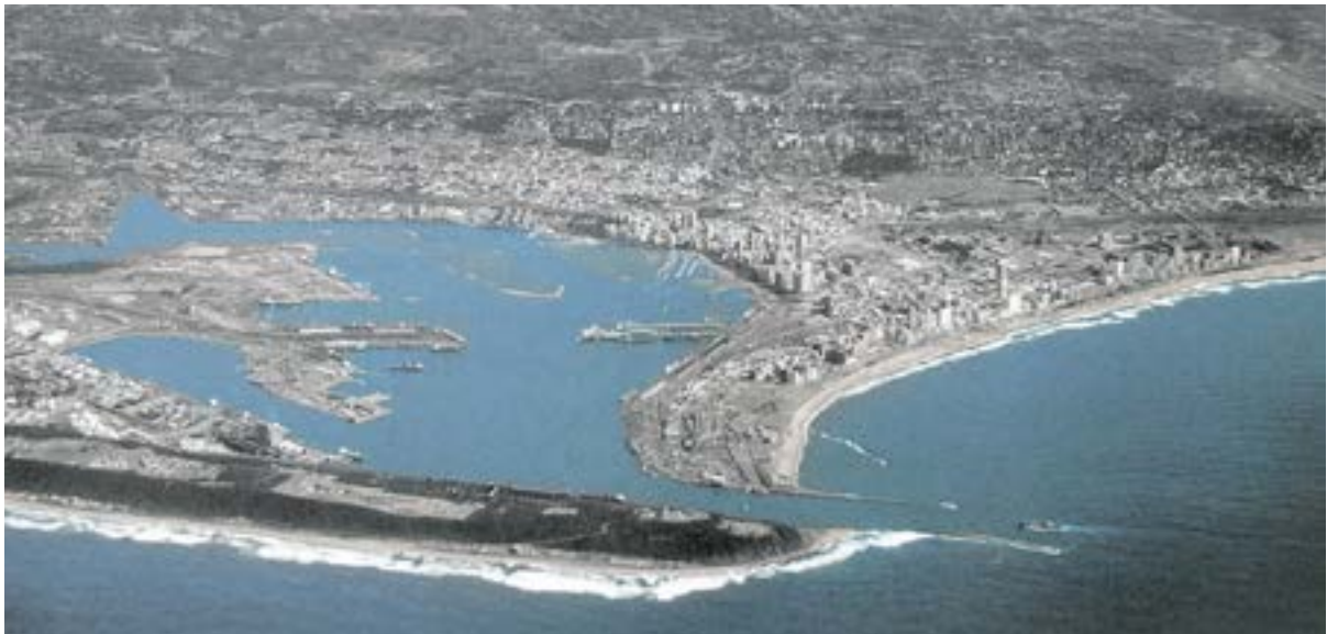
DURBAN SOUTH AFRICA

Durban is one of the fastest-growing urban areas in the world. It has a rich and ethnically diverse cultural history. Its port is the busiest in South Africa and also one of the largest in the world.