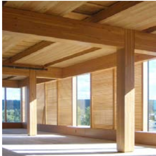
MGA Wood Innovation and Design Centre